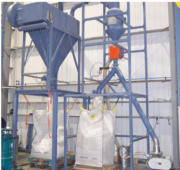
Cyclone separator with separator for fines HS 300 (big bag filling model)

The fines separator HS series is a new accessory for granulators and size reduction lines offered by HERBOLD and is suitable not only for new systems but can also be installed as an improvement to existing systems. The units are simple constructions and low-priced. They are of particular interest where beside-the-press granulators are in use, e.g. in injection moulding or blow moulding production lines.