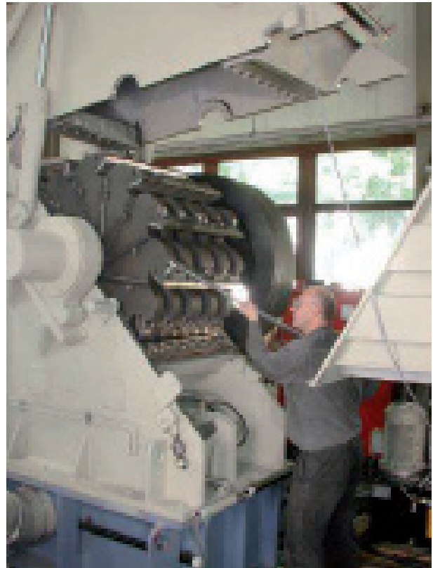
Rotorblade fastening by means of a torque wrench on a HERBOLD pipe granulator, type SMR 80/120

- thus indicating that it is high-time to regrind the blades! A timely regrinding assures lower costs for regrinding and less consumption of the blades.