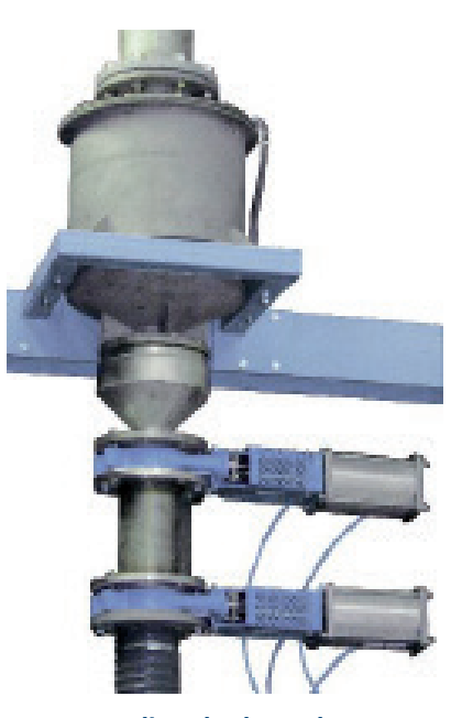
Heavy medium hydrocyclone