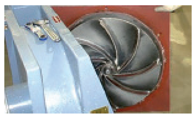
Fig. 7: The impeller has curved paddles that reduce wear and tear and prevent additional size reduction in the blower. Also available in heavy duty steel in the EHST series.