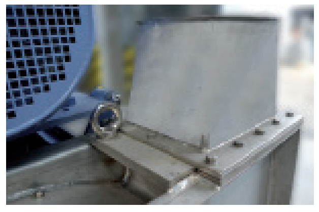
Fig. 6: ... as well as with exchangeable suction and pressure nozzles.