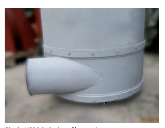
Fig. 3: HERBOLD also offers cyclone separators equipped with replaceable wear components .