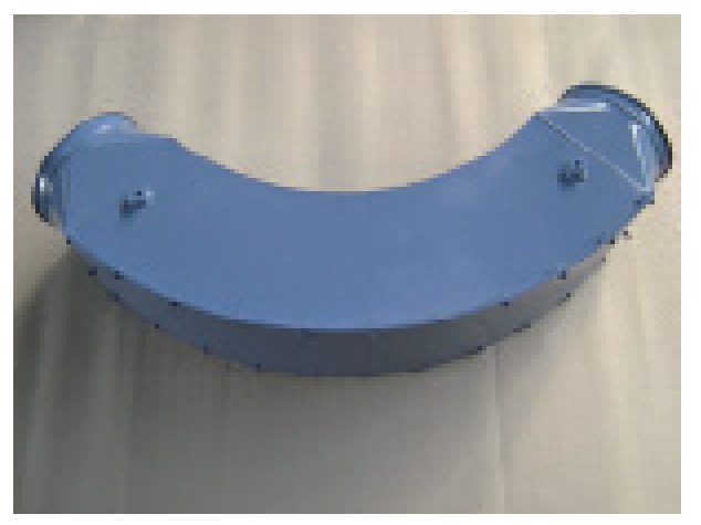
Fig. 1: The HERBOLD wear-resistant pipe elbows are prone to less wear than a traditional pipe e bow due to the larger radius.