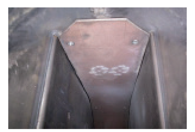
Fig. 5: The blowers are equipped with an exchangeable wear insert ...