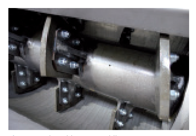
Fig. 8: Replaceable wear paddle