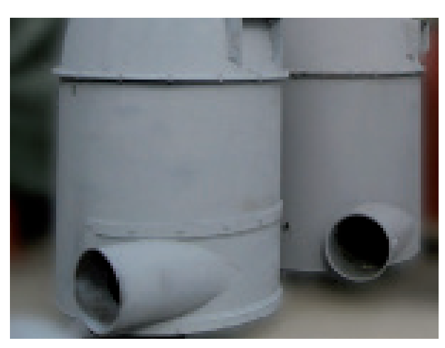
Fig. 4: The cyclone separator is available with and without exchangeable wear components.