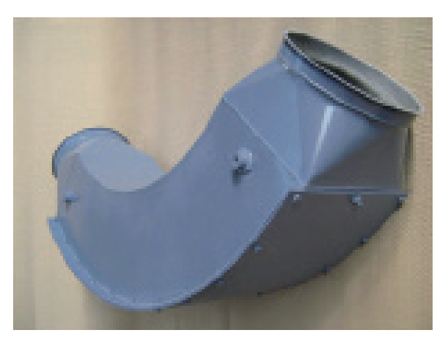
Fig. 2: These elbows feature exchangeable wear protection plates and allow the elbows to last longer and be used again.