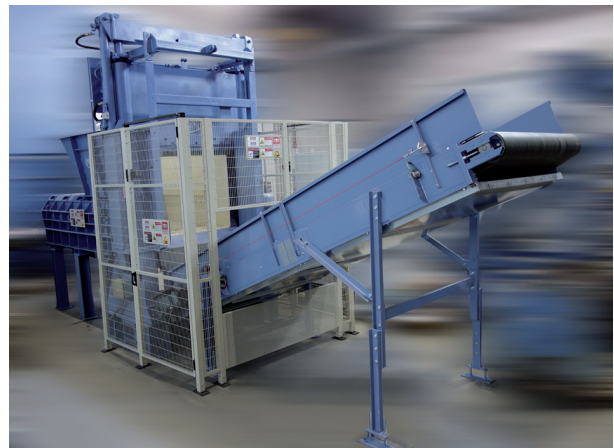
Fig. 1: Guillotine cutter HGS 150 with EWS hydraulic ram