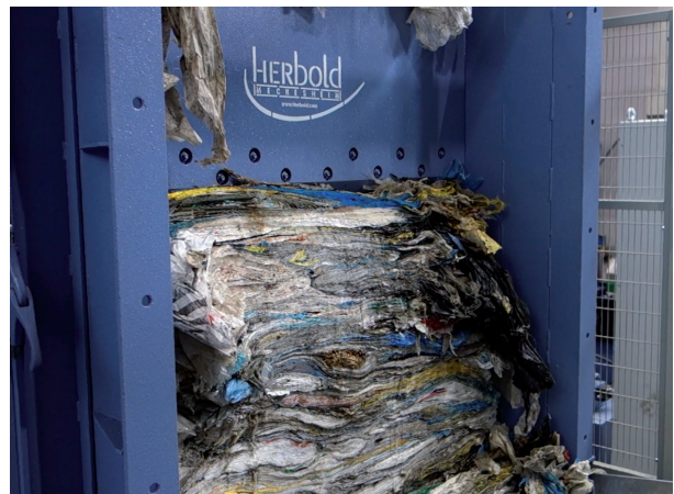
Fig. 2: Cutting the material portions lying under the cutting blade